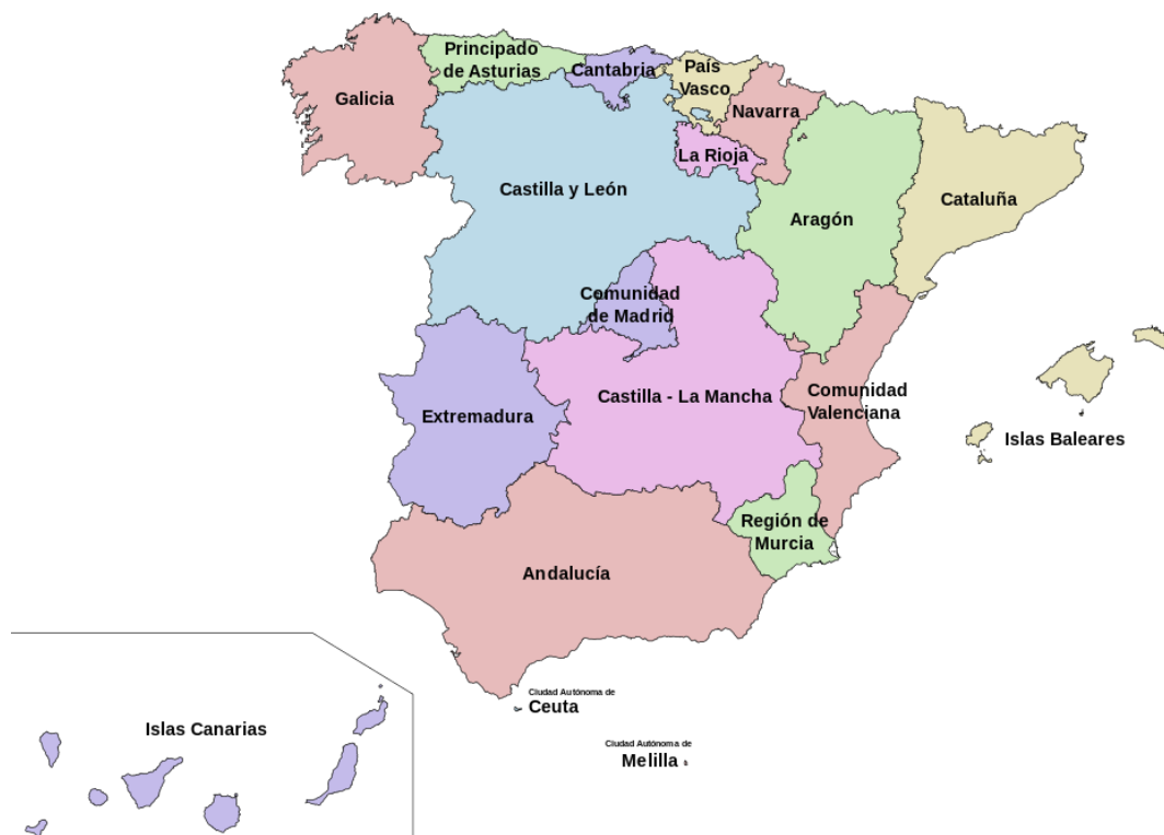
Map 1. Catalonia/Cataluña and the other autonomous communities of Spain.

Catalonia has never been an independent state and it has been a part of Spain since the unification of the crowns of Aragon and Castile more than five hundred years ago. However, with about 7,5 million inhabitants, its own language and culture, and a gross domestic product of almost 30.000 euros per capita, Catalonia would be a feasible nation-state. In fact, it would be a moderately-sized European state similar to Austria or Finland. Nonetheless, because there has been no window of opportunity to become independent, it still is a region. Most new states in Europe, such as Ireland, Estonia, Slovakia, Croatia or Georgia, were created in the aftermath of the First World War or after the fall of the Berlin Wall in 1989. 1 Since Spain did not participate in the Great War and was never communist, there was no obvious opportunity for Catalonia to secede from Spain.