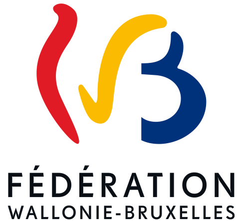
The logo of the Fédération Wallonie-Bruxelles